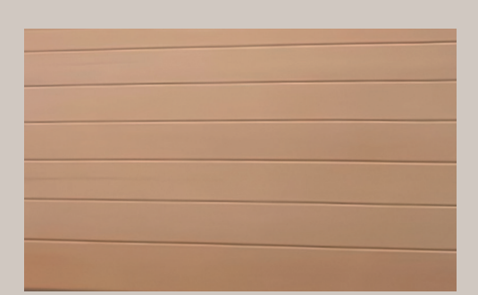
NO LIMITS Spruce Scantling, surface treated, hardly visible finger-joints

The natural material wood, with all its positive characteristics and special features, is taken into account and we can guarantee today and also in the future a sustainable supply.