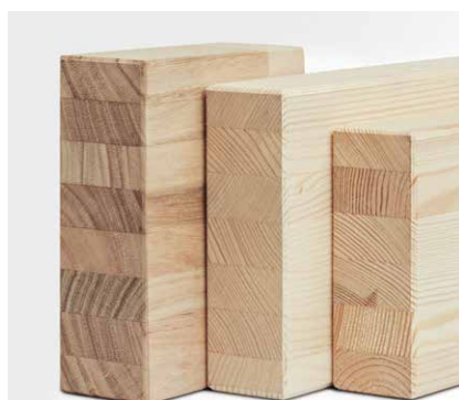
Conventional laminated posts

There are many options for the final cladding: diverse wood species (on request), stainless steel look.