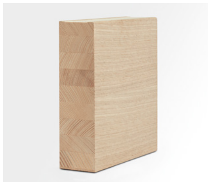
Premium laminated posts