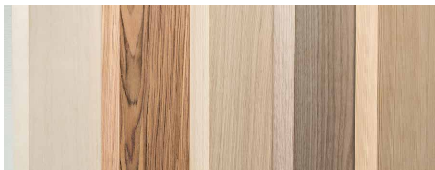
Laminated posts in the premium version