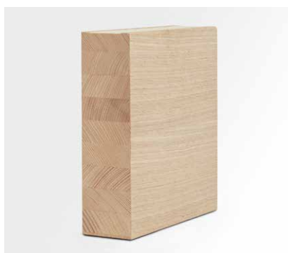
Premium laminated posts