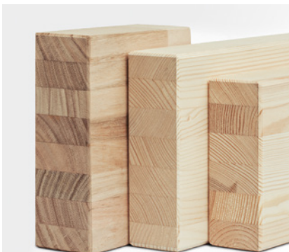
Conventional laminated posts

There are many options for the final cladding: diverse wood species (on request), stainless steel look.