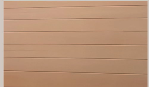
NO LIMITS Spruce Scantling, surface treated, hardly visible finger-joints

The natural material wood, with all its positive characteristics and special features, is taken into account and we can guarantee today and also in the future a sustainable supply.