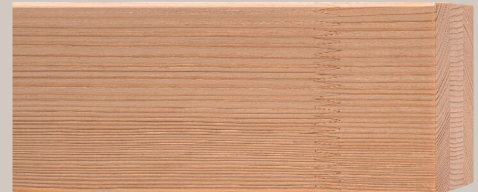
NO LIMITS Spruce Scantling, untreated

The barely visible finger-joints are reduced to the unavoidable minimum and only slightly affect the homogeneous look of the surfaces.